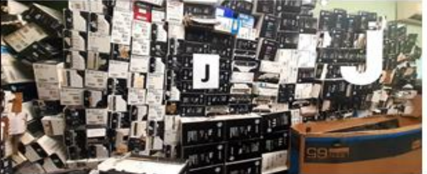
Stamp & Signature